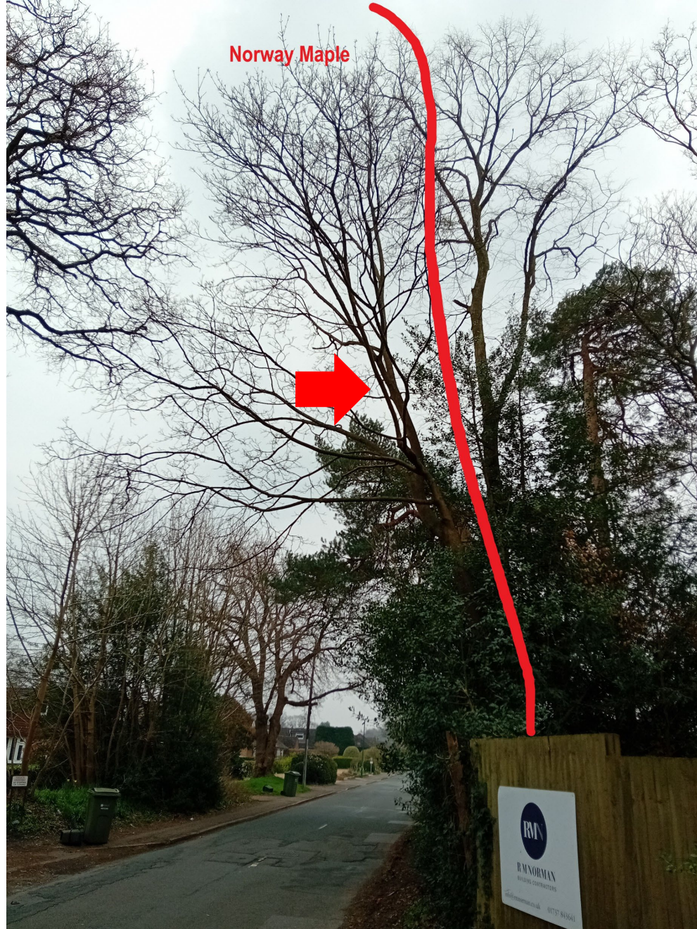
Southern View Potters Lane