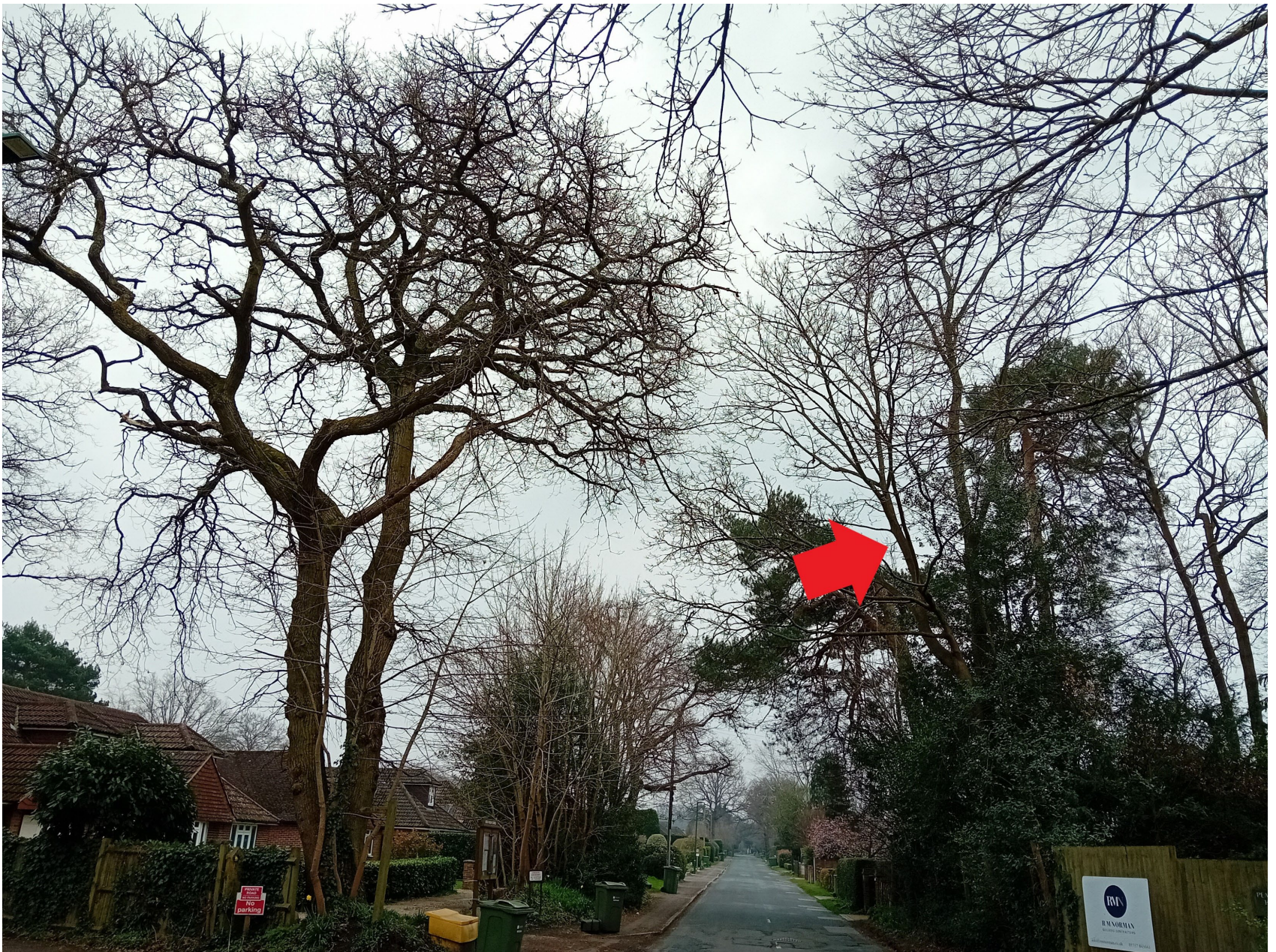
Looking South Potters Lane