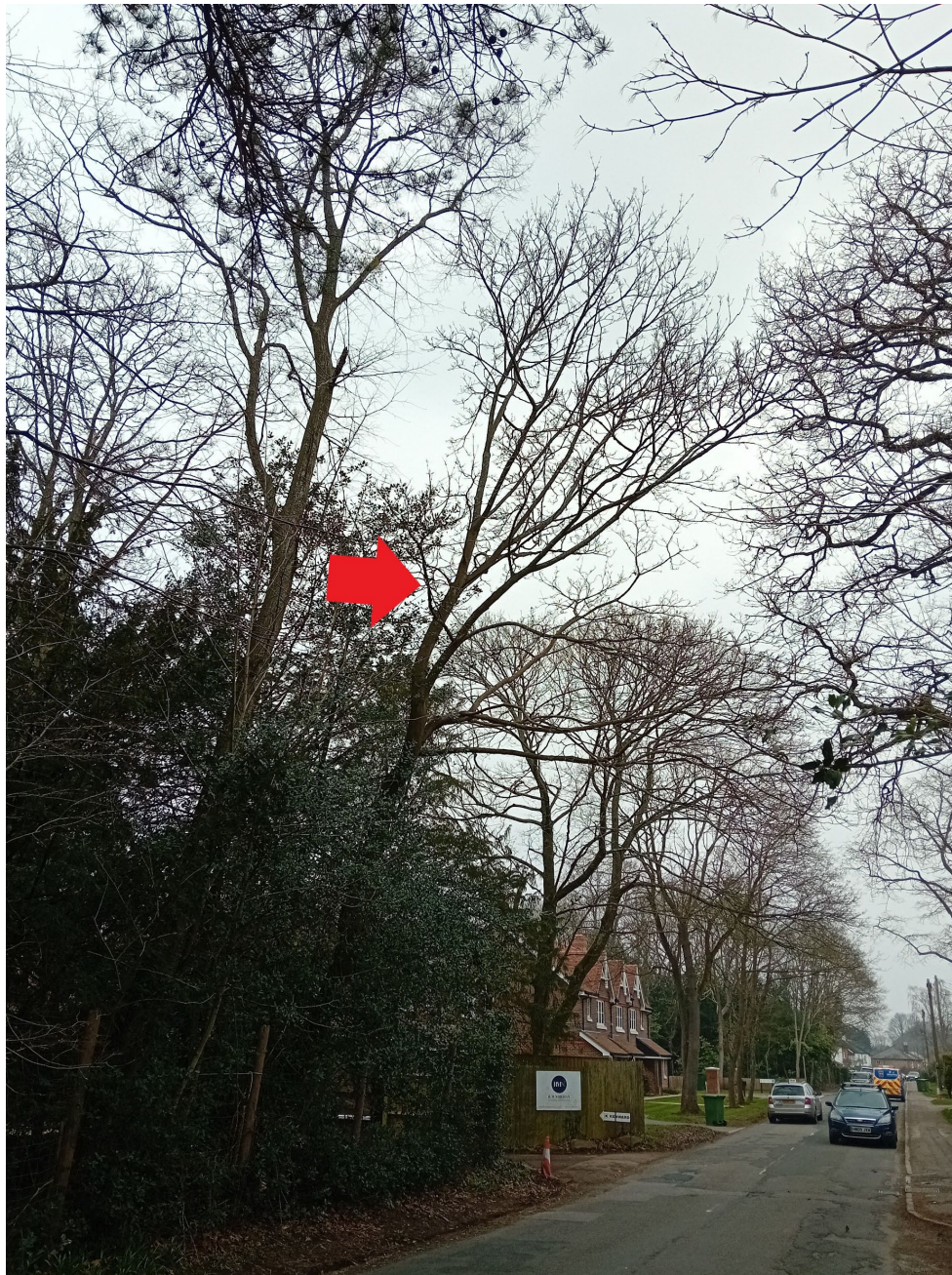
Looking North Potters Lane