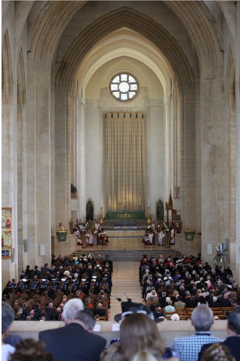
The service at Guildford Cathedral.