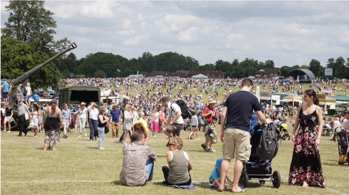
Static displays were open all day.