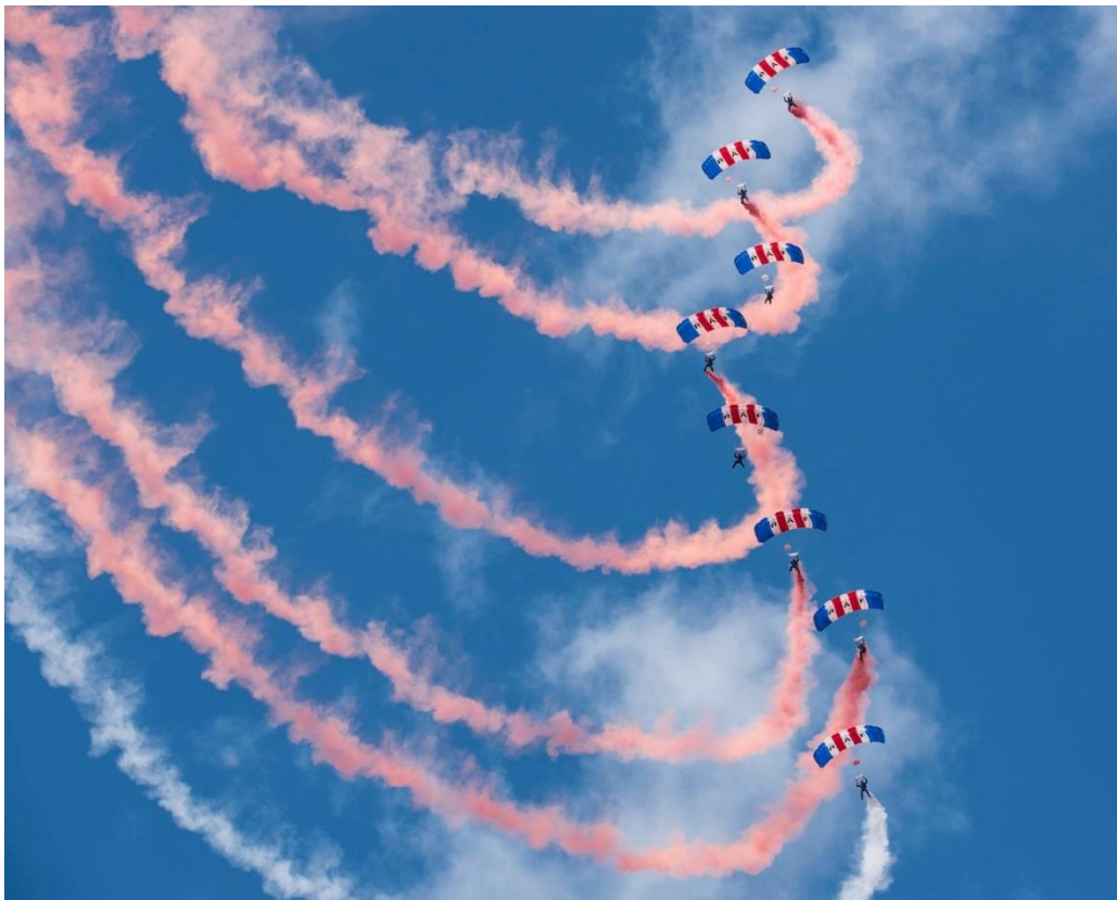
The RAF Falcons Parachute Display team.