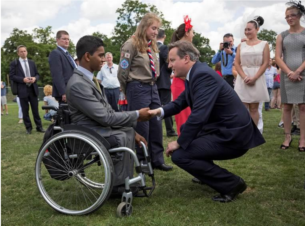
Prime Minister David Cameron met Guildford's Young Ambassadors at the event.