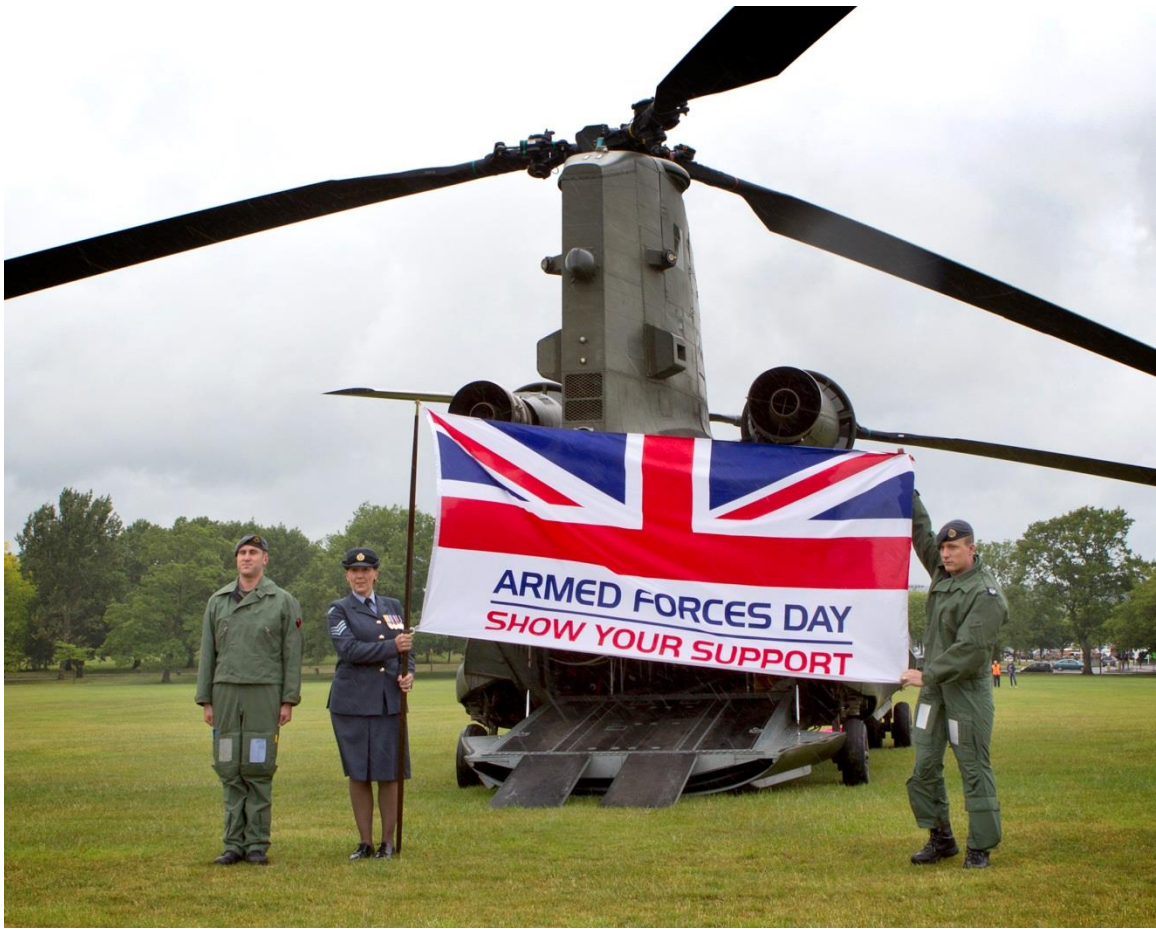
The Royal Air Force delivered the Armed Forces Day flag by air to Stoke Park.