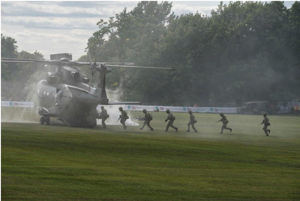
Displays were provided by all three services and the cadets throughout the afternoon. This is the Princess of Wales' Royal Regimental battle assault display, assisted by a Royal Navy Merlin helicopter.