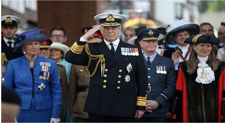
Prince Andrew took the salute, accompanied by the Mayor and the Lord Lieutenant.