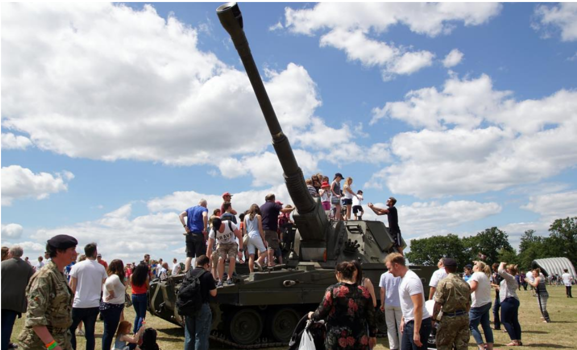
A static display tank.