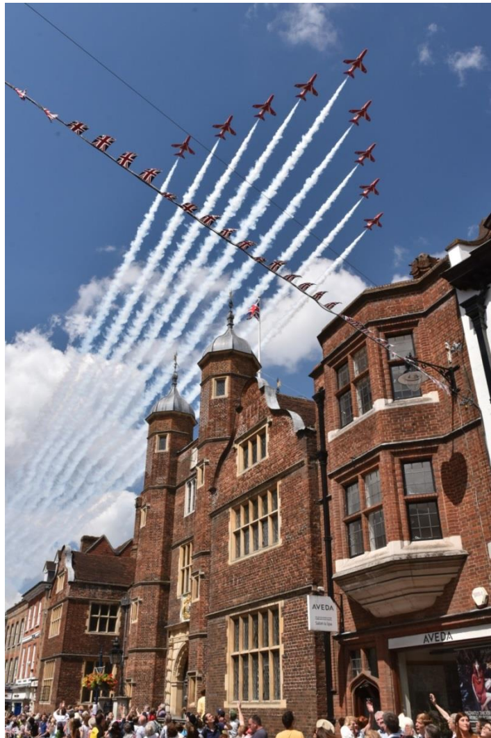
The Red Arrows overflowed the parade for their first pass of the day.