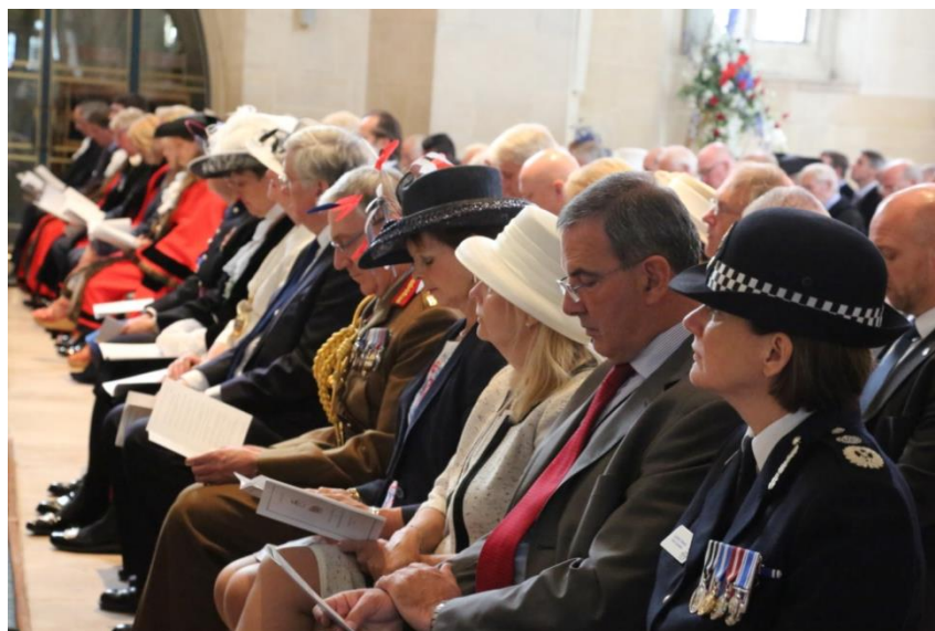
Guests at the Guildford Cathedral Service