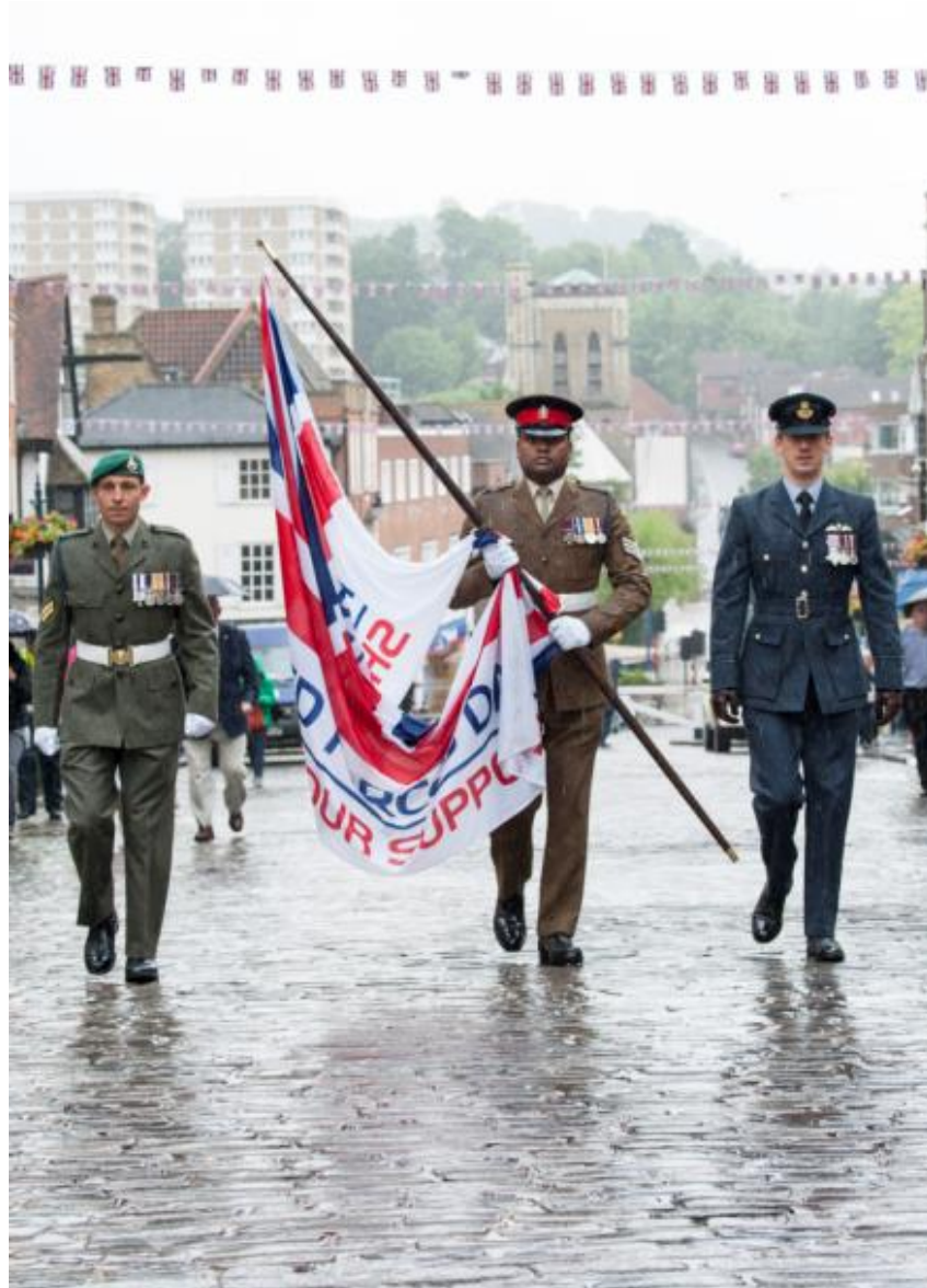
Representatives from all three services delivered the flag to Guildford Borough Council, to be raised at the Guildhall.