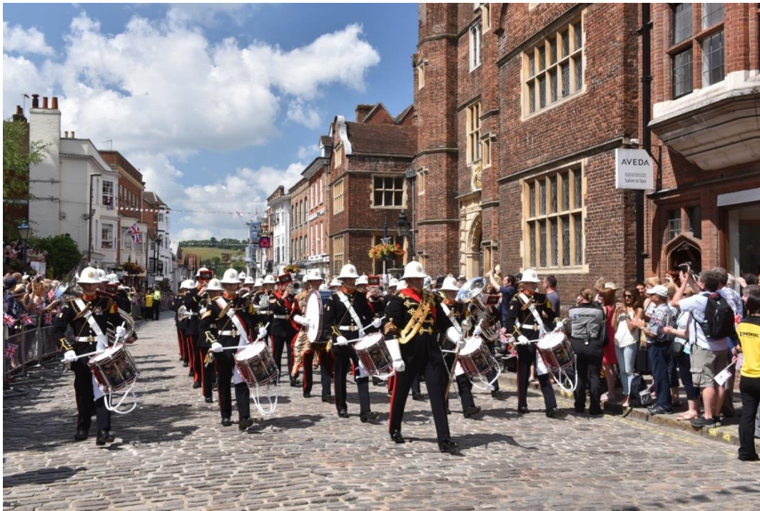
The Royal Marines Band playing up Guildford High Street.