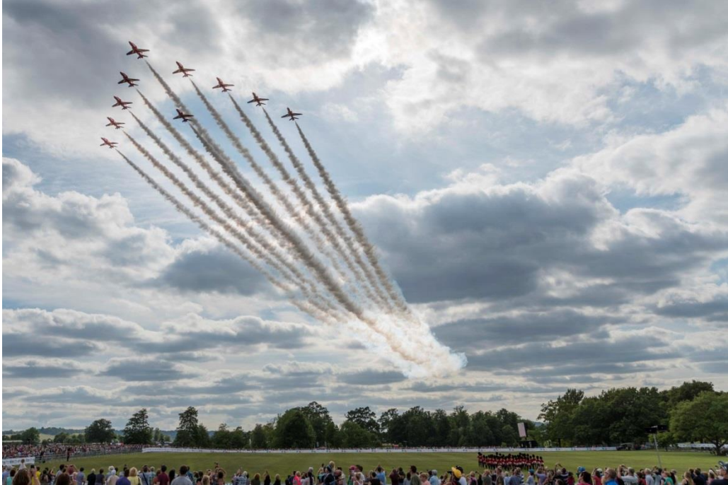
The Red Arrows returned for a second pass of the event.