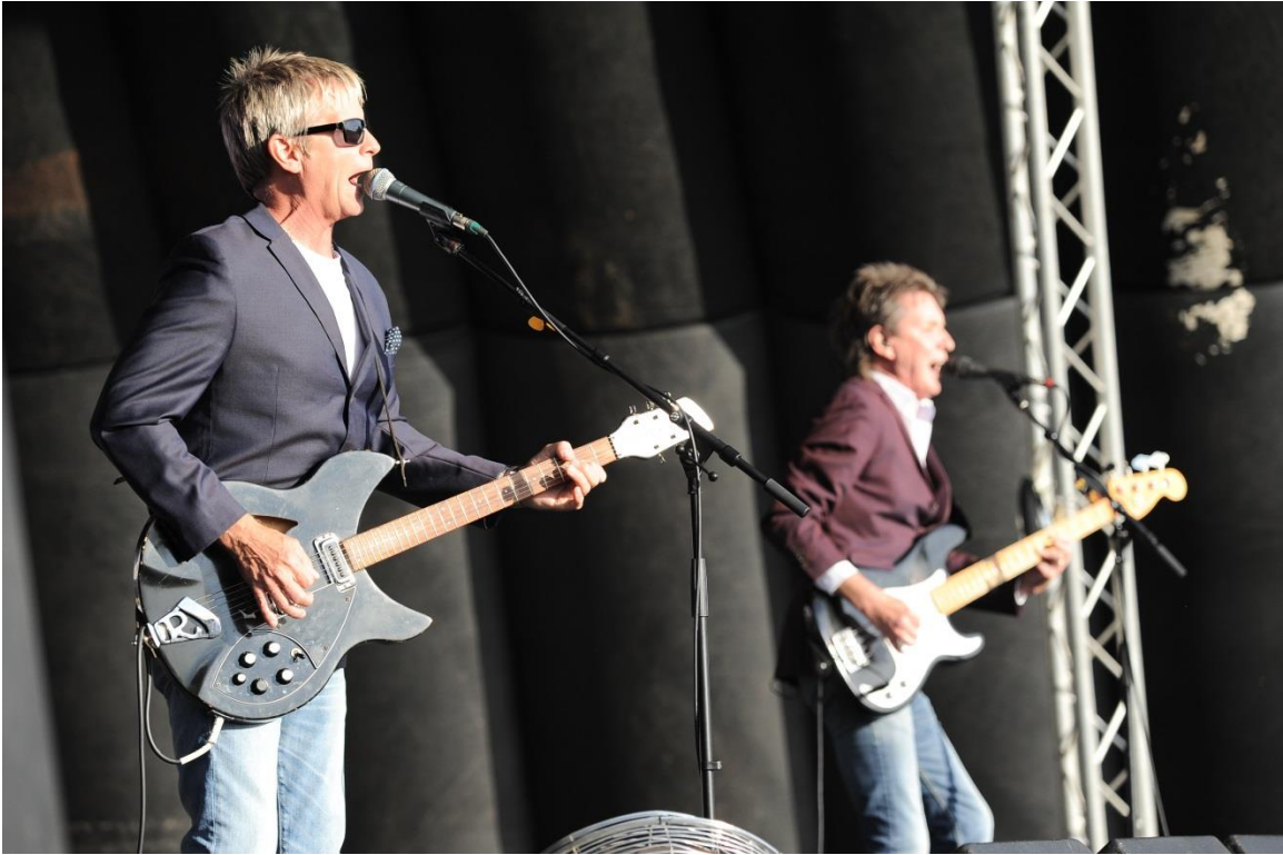
From the Jam played headlined the evening's concert.