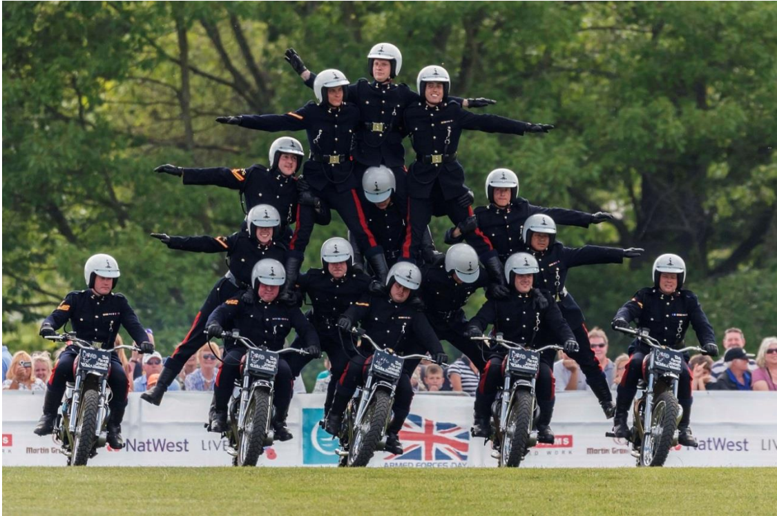
Royal Signals White Helmets motorcycle Display Team.