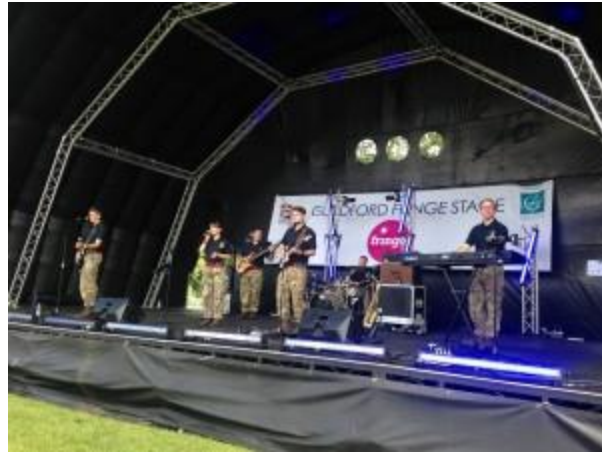
The Band of the Adjutant General's Corps played the Guildford Fringe Stage.