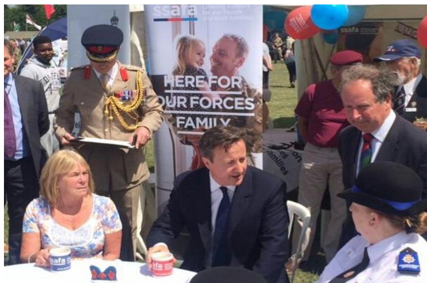
David Cameron presented Veterans badges to local representatives including members of Surrey Police.