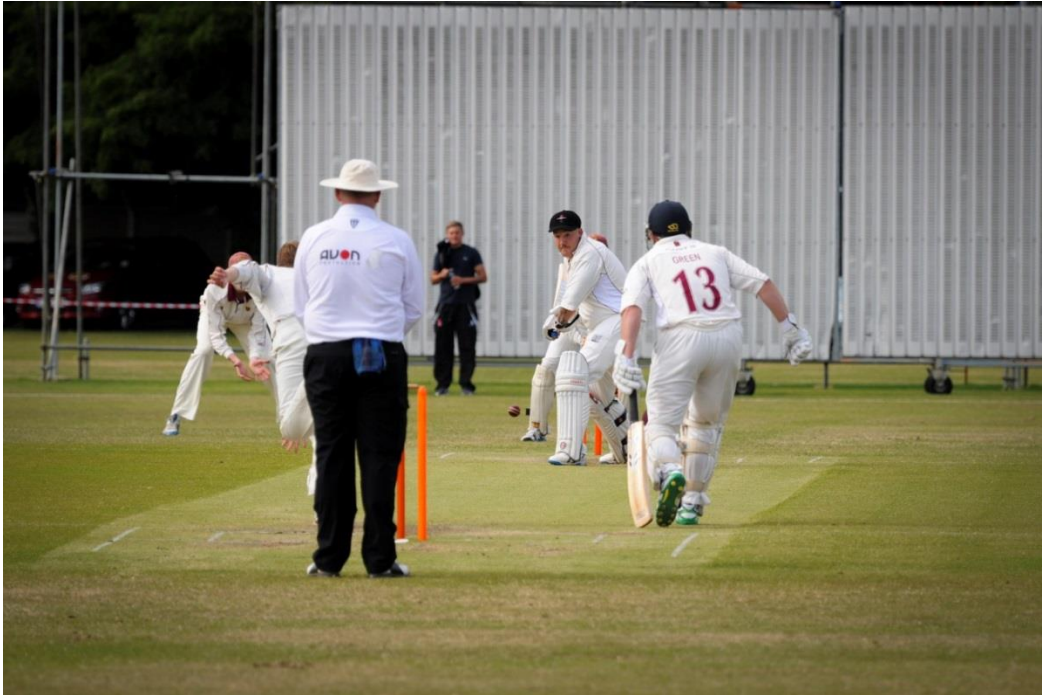
A tri-service team played Guildford Cricket Club at Guildford's Woodbridge Road Grounds