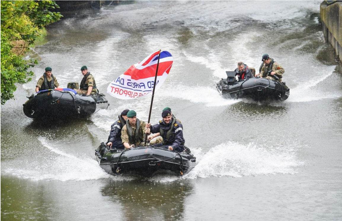
The Royal Navy transferred the flag by water from Dapdune Wharf to the Town Wharf.