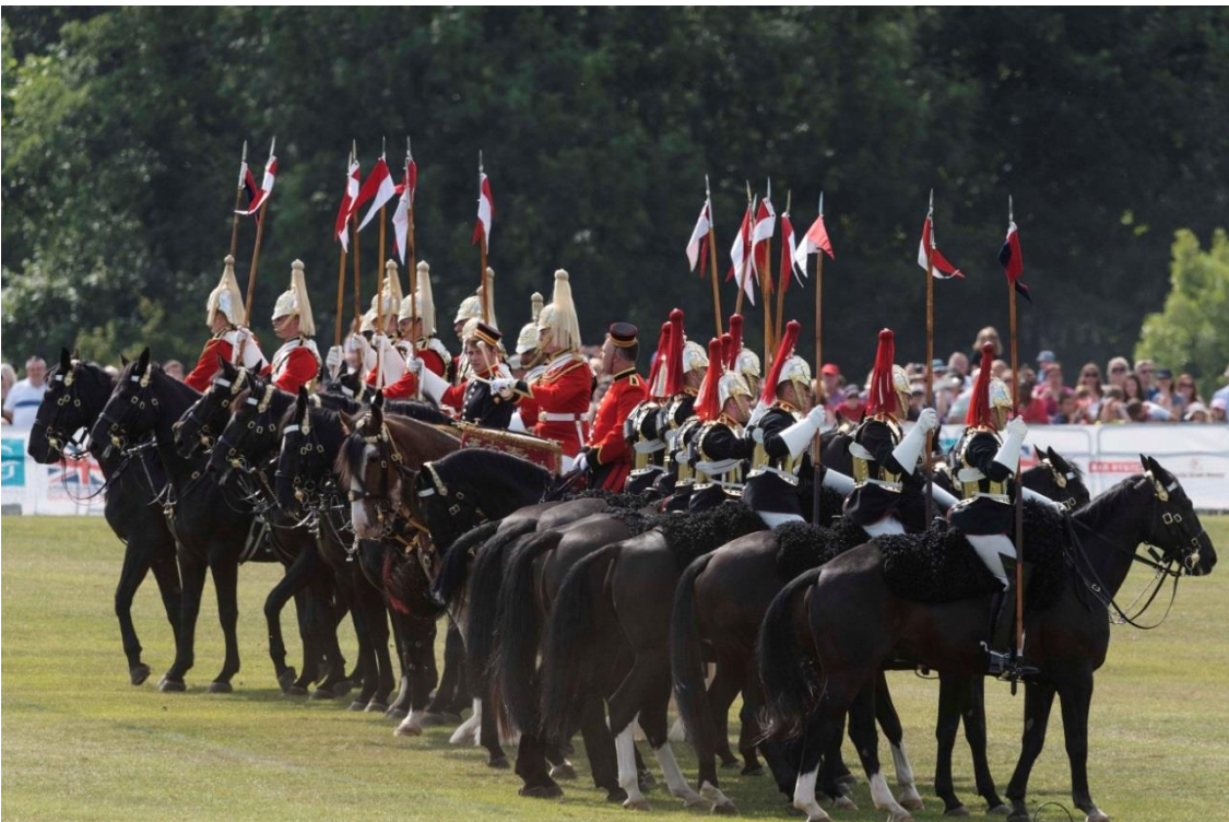
The Household Cavalry Musical Ride.