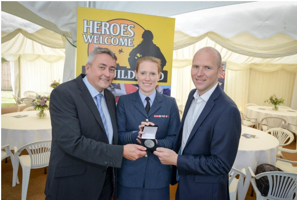
Commemorative coins were given to all participating service personnel, cadet and veterans by Guildford Borough Council. These were paid for by Ash Contracting.