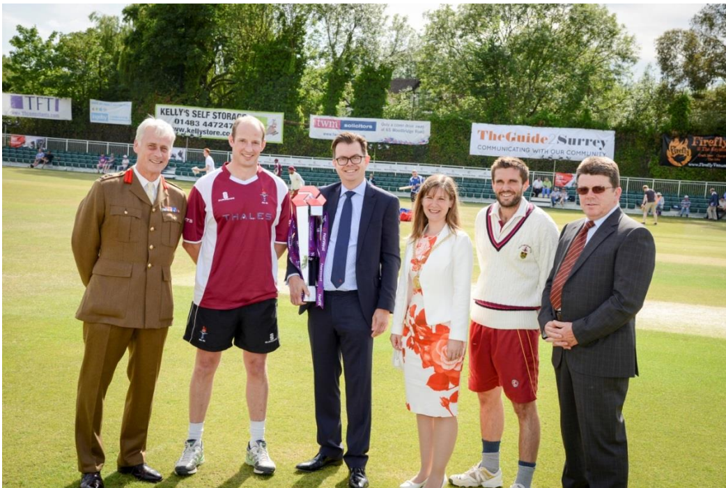
Sponsors and service reps attended the event along with it being open to members of the public. Natwest, sponsors of Twenty20 cricket, brought along the Twenty20 trophy for people to have a look at and take pictures with.