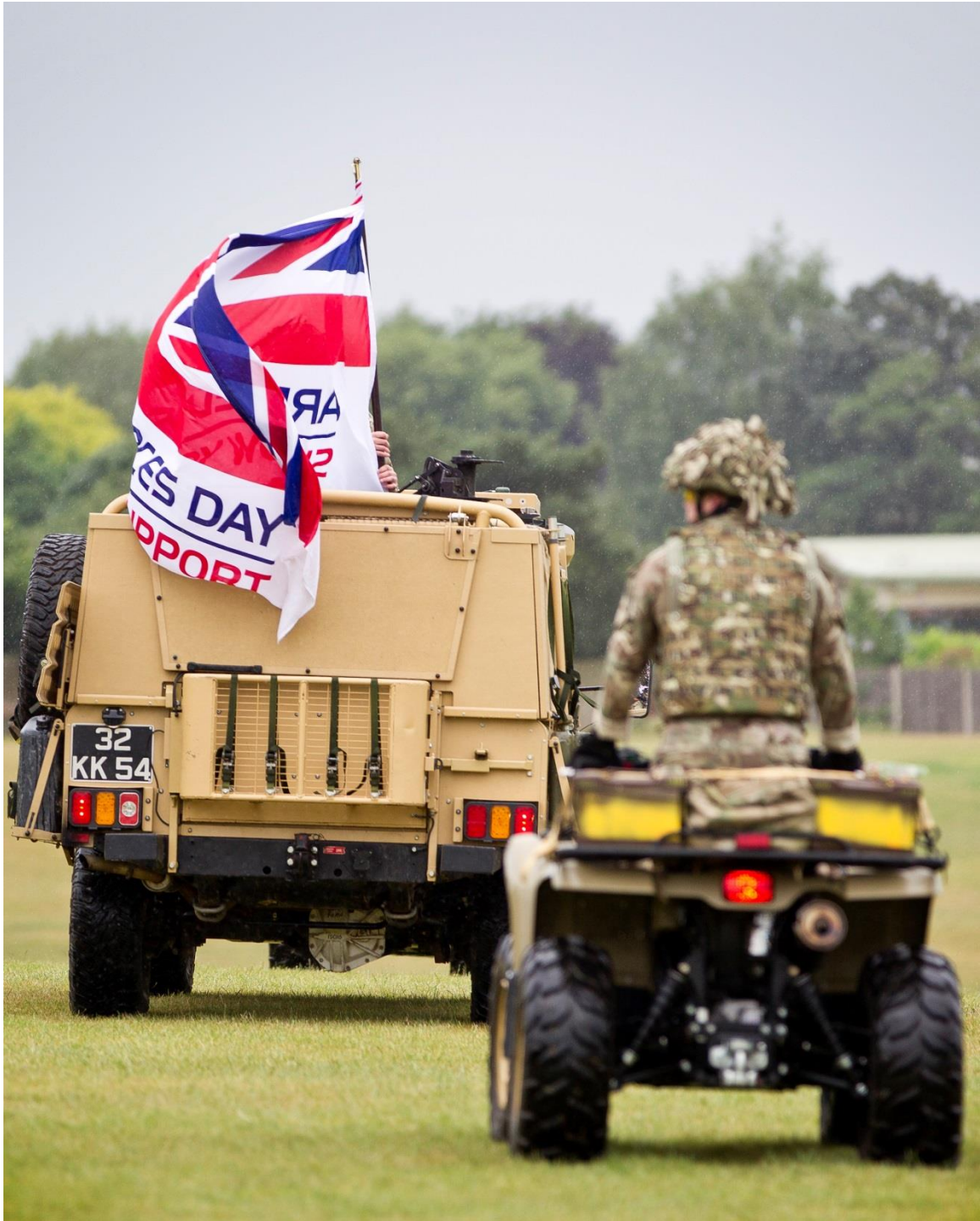
The Army transferred the flag by land from Stoke Park to Dapdune Wharf using armoured vehicles and quad bikes.