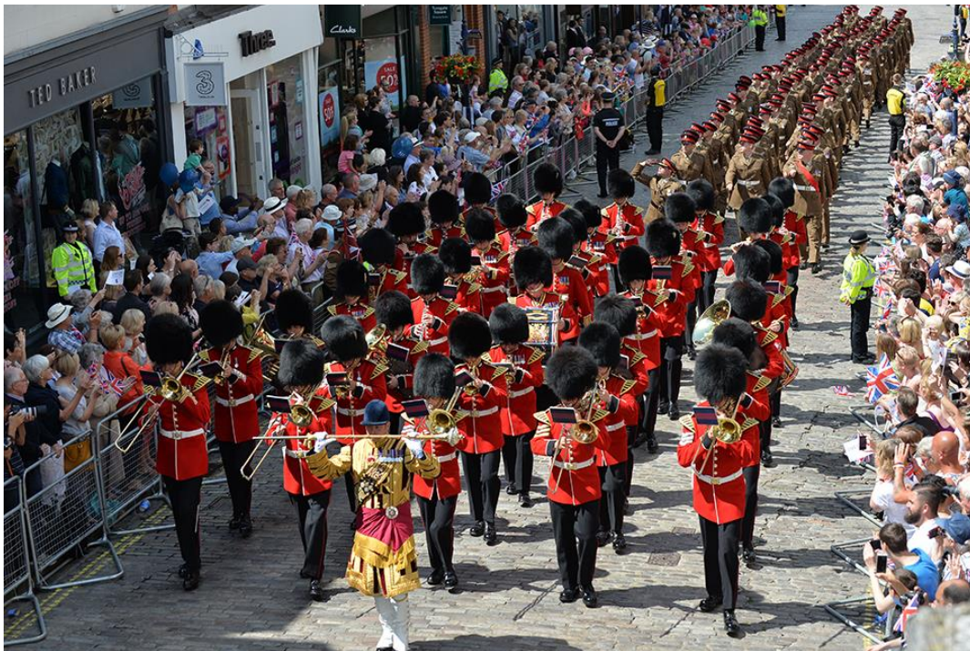
The Coldstream Guards played up the High Street.